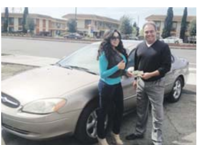
Local resident turns your cars into cash

Do you have a Car, Truck, RV, Motor Home, Boat, jet ski, Motorcycle. Paid or not?